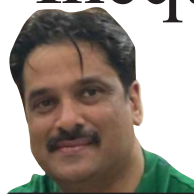
BY DR PAWAN SURI

India is the largest democracy in the world and for a country to be democratic in true sense, the most important prerequisite remains Equality for its citizens. This means that every single citizen irrespective of race, religion, gender, caste, class or birth is equal in the eyes of law. However, on ground such an ideal situation does not exist and even today many forms of inequalities are still prevalent in society.