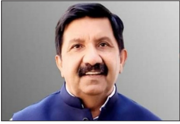
Fancy registration number