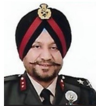
BY MAJ GEN HARVIJAY SINGH (RETD, SM)

“They [China] are the bigger economy, what am I going to do? I am a smaller economy. Am I going to sort of pick up a fight with a bigger economy? It is not a question of reacting. It is a question of common sense.” S Jaishankar, External Affairs Minister India.