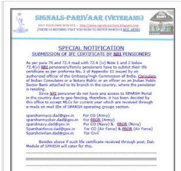
SPARSH NOTIFICATION - DLC NRI

their Circular No 647). This youtube video also carries some details - https://youtu.be/o4SEhI21HDg