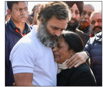
Rahul Gandhi consoles Chaudhary Santokh Singh's wife.

Earlier in the day, Aam Aadmi Party (AAP) Rajya Sabha member Baba Balbir Singh Seechewal visited Singh's residence to offer his condolences to the bereaved family.