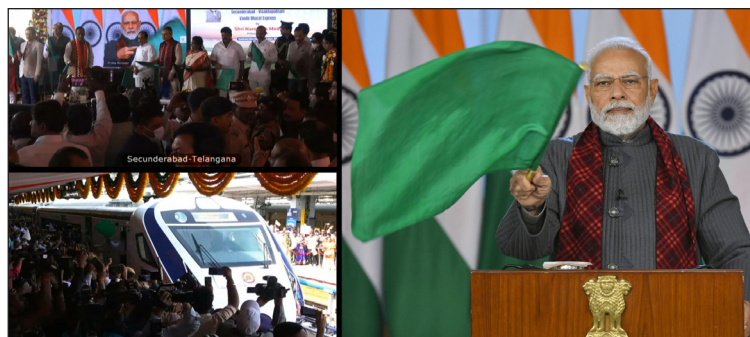
PM flags off Vande Bharat Express train connecting Secunderabad with Vishakhapatnam via video conferencing on Sunday.

the resolutions and capability of New India. It is a symbol of that India which has started on the path of rapid change - India which is restless for its dreams and