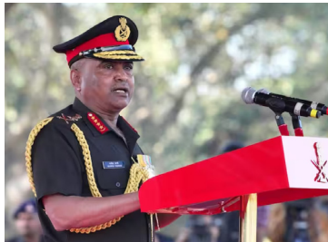
GEN MANOJ PANDE WAS SPEAKING ON THE OCCASION OF THE 75TH ARMY DAY CELEBRATIONS IN BENGALURU.

Pande said: "Last year, the Army firmly faced security-related challenges and ensured security of borders actively and strongly. Army took steps to improve