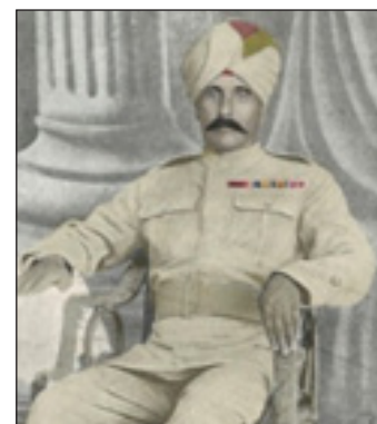
(London Gazette-13 May 1916).

When this was not permitted, he stripped off his own clothing to keep the officer warmer, and stayed with him just before dark, when he returned to his shelter. After dark he carried the first wounded officer back to the main trenches and then returning back with a stretcher carried back his adjutant. He set a magnificent example of courage and devotion to his officers.